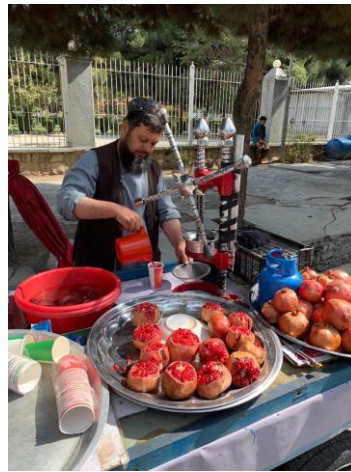
Praise and Prayer

Romans 15:20-21 My ambition always has been to preach the Good News where the name of Christ has never been heard rather than where a church already has been established by someone else. I have been following the plan spoken of in the Scriptures, where it says, "Those who have never been told about Him will see, and those who have never heard of Him will understand."