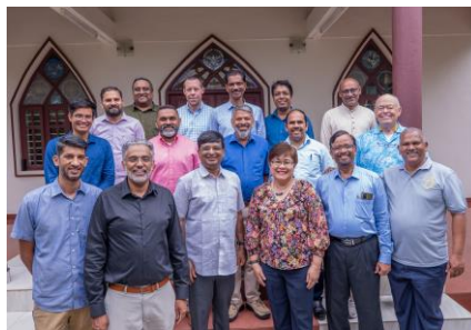
ATA accreditation team with ETS faculty

Exciting news also comes from the Evangelical Theological Seminary (ETS), as we proudly announce the re-accreditation of its Master's and D.min programs. In addition to this achievement, we have secured new accreditation for our online and PhD programs. It's noteworthy that the Asia Theological Association, accrediting nearly 360 institutions in Asia with close to 200 in India, has recognized our institution. Of significance, we stand among a select few - only three institutions in India within the ATA network that offer a PhD program. This accomplishment aligns with our broader mission to supply qualified faculty to the numerous institutions across India and Asia, marking a significant milestone in our educational endeavors.