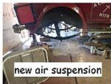
new air suspension

For those into old cars, I have replaced the Dodge rear axle with a Grand National 9" & disk brakes. All four wheels are 15" mags with Wrangler M/S truck tires. The old radiator leak is fixed. I'll be ready for my next trip Across America with Christ in the spring. It will probably be clockwise around the USA.