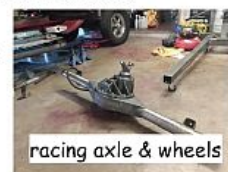
racing axle & wheels

My home in France needs major care because of my absence. Grass to my waist, wood to cut for heat, roof leaks to fix and my little car inspection are all ahead. So, your prayers are greatly appreciated. I look forward to visiting unsaved neighbors and other friends to give them a Gospel calendar for 2024. I'll be traveling on weekends, but weekdays are always good for conversations in my village as I go to the Post Office and grocery store. It will be good to see those the Lord has saved and to encourage them.