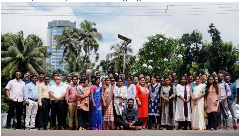
ACA Missions Conference 2023 – Kochi

"I got a healing touch to my wounded and weary heart through the messages the speakers brought to us. I have been quite discouraged at this point of my life and ministry after all my years of life and ministry investment came to nothing. I almost wanted to say, "Lord, I am done with all my physical limitations and abnormal conditions." But the conference co-incidentally came at this time which gave me a new impetus to hang on with perseverance. It challenged and encouraged me to raise the bar of my spiritual life and ministry for greater challenges ahead. The preachings were authentic because the preachers preached their ongoing lives and ministries."